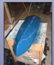
1. Building a molding frame and shaping clay to hull specs